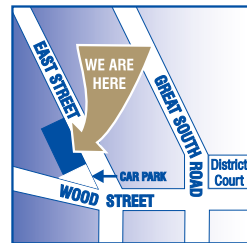
PAPAKURA OFFICE: Cnr East St & Wood St, Papakura Telephone 09 299 8550

Discuss making an Advance Directive when seeing us about your Enduring Power of Attorney.